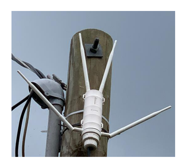
At the Clubhouse