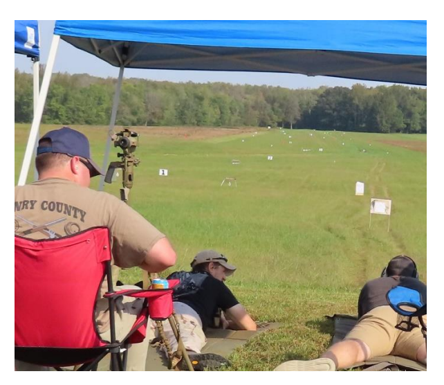
Page 5 of 9