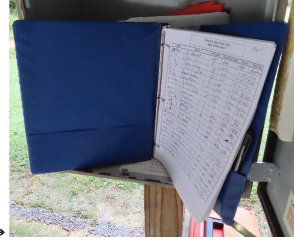
←In the box – Sign the book! →