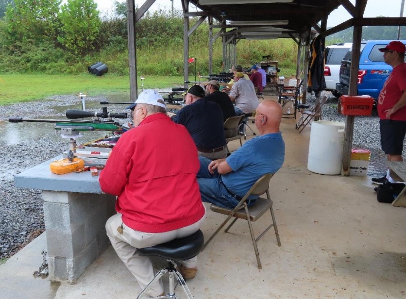
Page 6 of 12