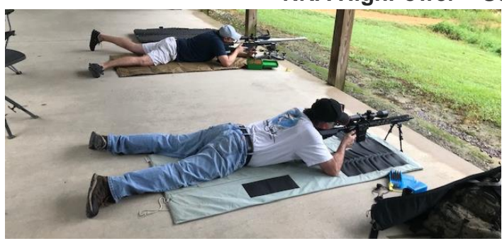
NRA HighPower – September 4<sup>th</sup> & 5<sup>th</sup>