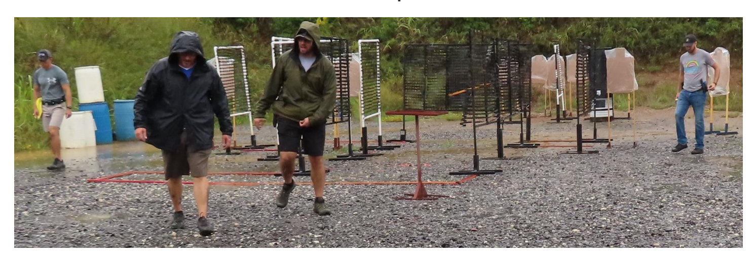
USPSA – September 18<sup>th</sup>