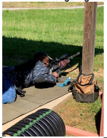
NRA Mid-Range High-Power F-Class, Prone and Service Rifle – May 2020 Match